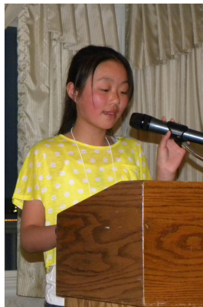
Laws of Life essayist reading her essay during Character Celebration.

Connecticut's ten essay finalists, family members, teachers and statewide judges were invited and all 10 students attended the celebration. Two students volunteered to read their essays, which identified the themes of living a productive life and