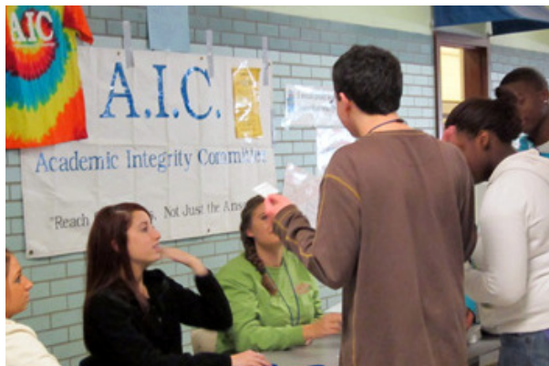
AIC students administering their academic integrity pledge drive to fellow students during the school lunch period.

Meetings of the collaborators were facilitated through an on-line meeting host where PowerPoint presentations delivered content for lesson design. Participants were able to exchange ideas and ask questions and then design their own lessons that were placed on a project blog for shared review. The process helped SEE create a clear lesson outline for